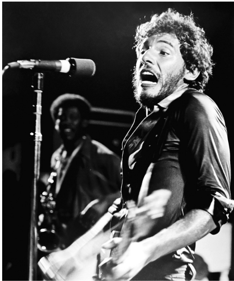
The Nepenthe Gallery presents an exhibition on Bruce Springsteen, "Greetings from Alexandria, VA" on May 8-10, 2026.

115 Prince St.: Situated on Alexandria's iconic Captain's Row, this elegant townhome combines timeless charm from colonial times, maritime history, and garden beauty. Built in 1783 and surveyed by a young George Washington in 1784, it originally served as a haven for sailors, offering food, lodging, supplies, and a well-used tavern that is now the dining room. After a fire in 1827, the lot sold for just $100. The current brick house was constructed in 1853 by an Italian ship captain and his Irish wife. From rare documents, we know the history of each owner and have copies of every deed. There are even documented ghost stories. Pine floors, crown moldings, and five fireplaces showcase its enduring character. A detached kitchen once stood in the garden to prevent fires, and the parking space was once a chicken coop. A grand living room, added in 1938,