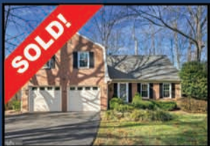
4302 Adrienne Dr | $899,000