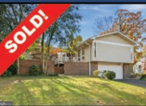
3713 Maryland St | $780,000