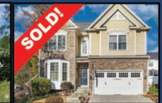
8047 Fairfax Rd | $1,375,000