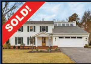
4206 Pickering Pl | $1,261,000