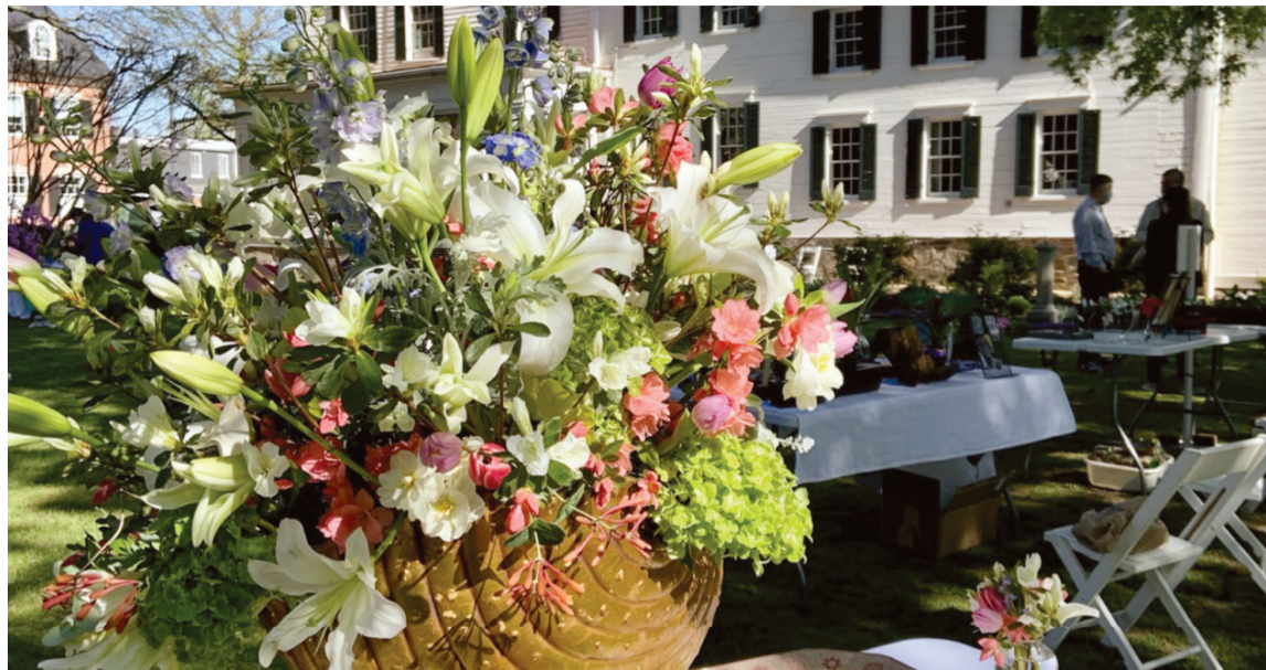
The Historic Garden Week Old Town Alexandria House and Garden Walking Tour takes place Saturday, April 18, 2026 in Alexandria.