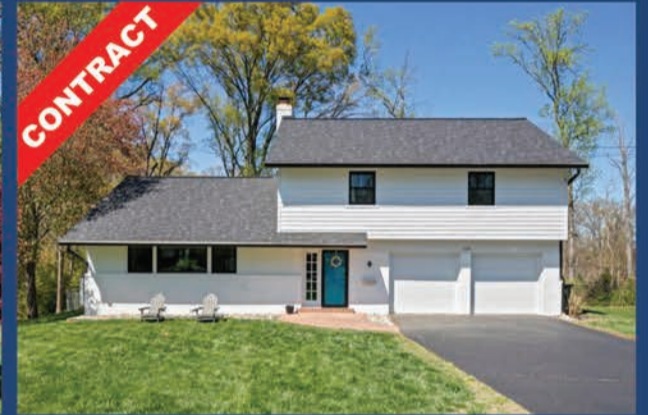
3104 Little Creek Ln | $906,000