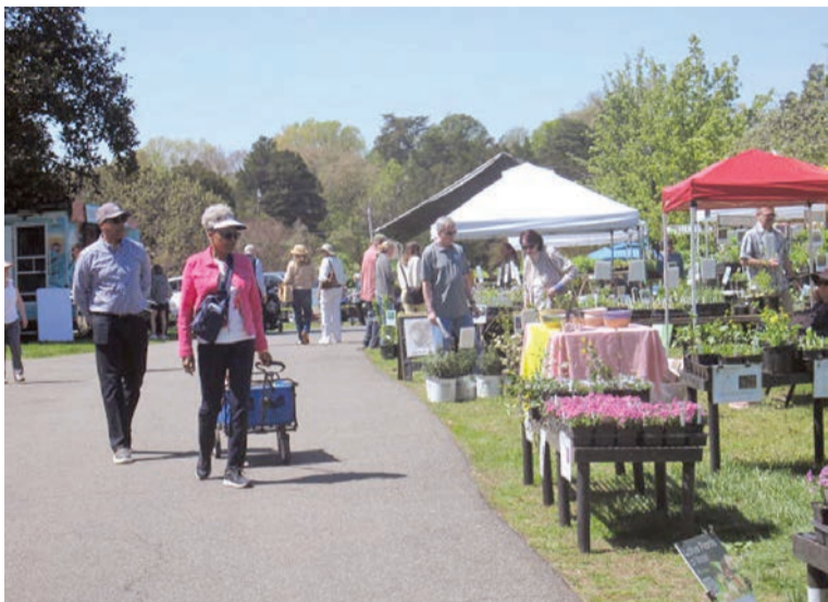
AHS provided carts for shoppers to carry their purchases at their annual spring garden market at River Farm.