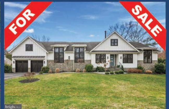
2203 Pennsylvania Blvd | $2,200,000