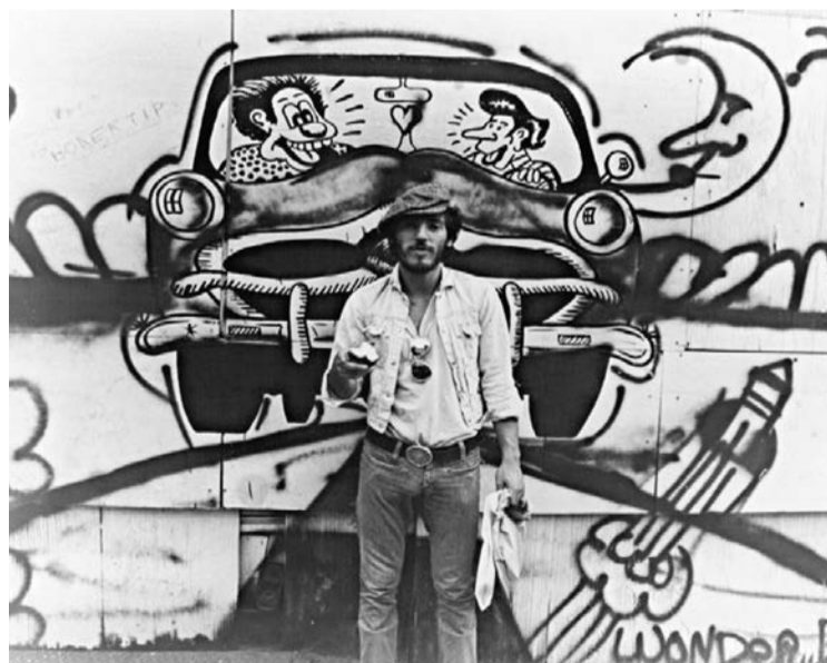
Against a wall graffiti picture.