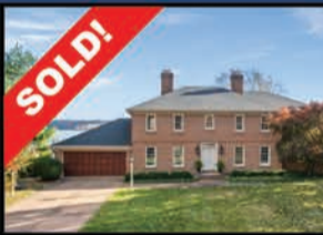
3903 Belle Rive Ter | $3,700,000