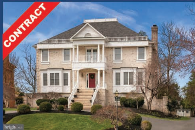
9498 Lynnhall Pl | $1,664,000