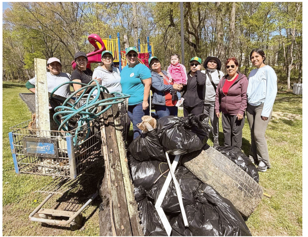
Volunteers and Friends Of Little Hunting Creek removed all kinds of trash from the stream on April 11, an annual cleanup.