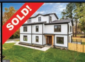
1600 Lafayette Dr | $1,565,000