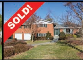
4008 Sulgrave Dr | $960,000