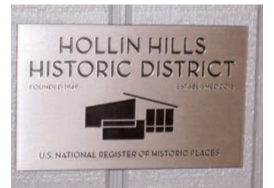
The two plaques available to Hollin Hills homeowners.