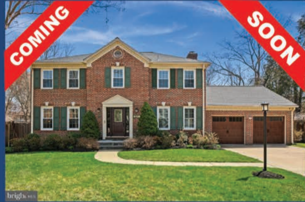
9426 Mount Vernon Cir | $1,595,000

43 homes SOLD in 2026 so far and 80 homes SOLD in 2025!