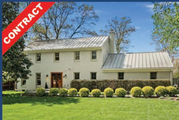
9410 Ferry Landing Ct | $1,300,000