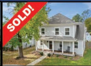
6404 13th St | $1,245,000