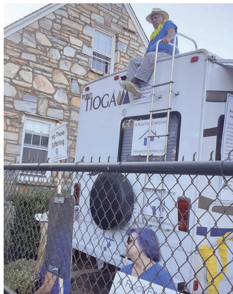
Back in 2021, one of the Kennedy Shelter Allies showed up in force to support the county effort for a fire station and housing. www.connectionnewspapers.com