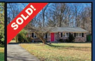
5304 Cedar Ct | $599,950