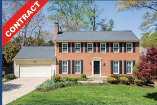
8306 Crown Court Pl | $1,200,000