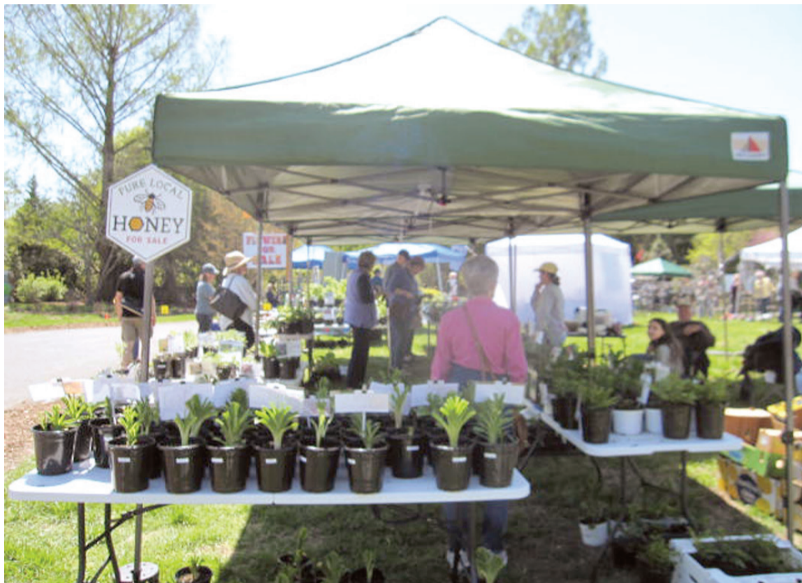
Forty vendors engaged plant enthusiasts for two days at the American Horticultural Society’s annual two-day spring garden market at River Farm.