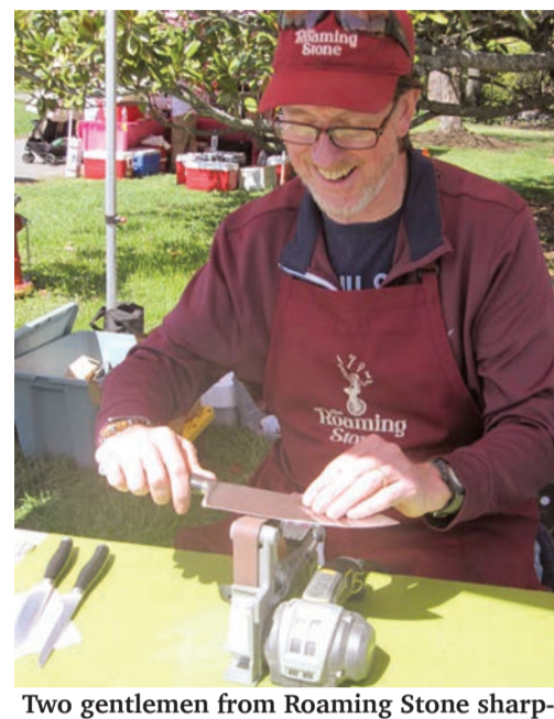
Two gentlemen from Roaming Stone sharpened knives and gardening tools at AHS annual spring garden market at River Farm.