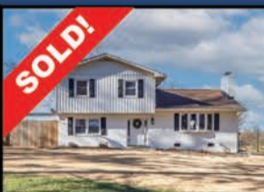
4301 Laurel Rd | $740,000