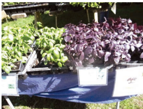
Two varieties of aromatic basil lured shoppers.