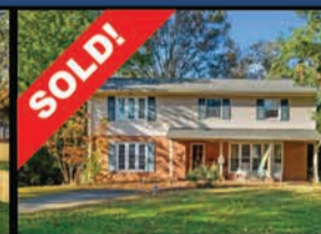
2410 Ryegate Ln | $760,000