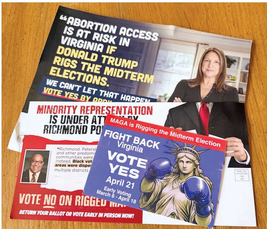
Ads bombard voters' mailboxes, doorsteps, and media, urging turn-out for the Special Election on Redistricting. The consequences could have national implications.