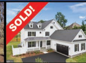
3608 Center Dr | $1,550,000