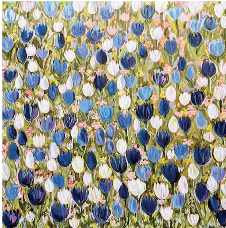
More Moments of Art at River Farm runs April 3 to June 12, 2026 in Alexandria.